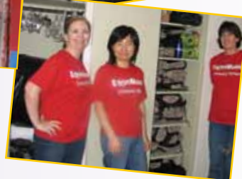
Consolidate, sort and organize our in-kind donation closet including our hurricane preparedness supplies