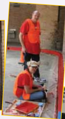
Power wash and paint curbs around our seven acre campus