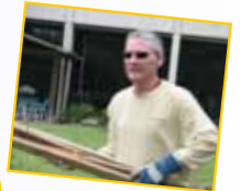
Clear out debris and foliage from behind Cullen Residence Hall by recycling and filling a 30 yard dumpster