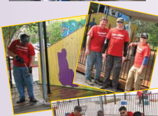
Power wash, repair and stain the deck around our boxcar