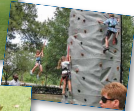
The rockwall for kids and adults was a huge hit!