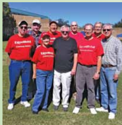
ExxonMobil volunteers help set up NovemberFest on Friday.